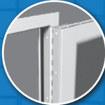
Full-length Piano Hinge