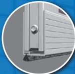
Adjustable Bug Sweep

All PCA doors come in one package, complete with: