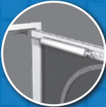
Rust Free Closure Tube