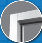
Quiet Close Wool Pile Lined Z-bar

The Universal Installation Kit allows your door to be installed left or right, in-swing or out, and includes: